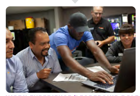
WORK EXPERIENCE/LEADERSHIP ROLE (Lead Software Developer)