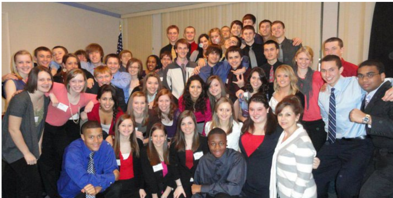
Iowa BPA students