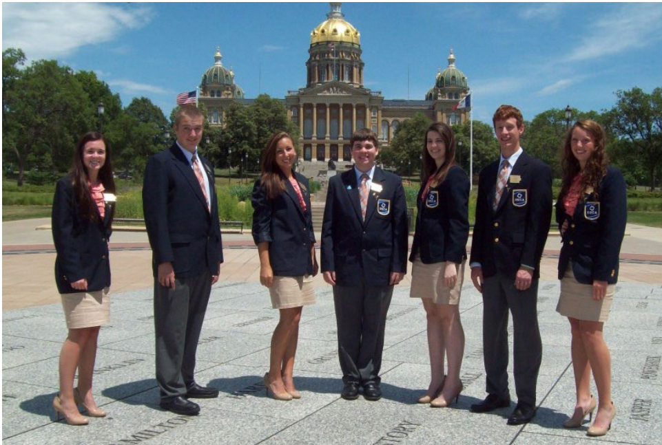
Iowa DECA students at the state capitol