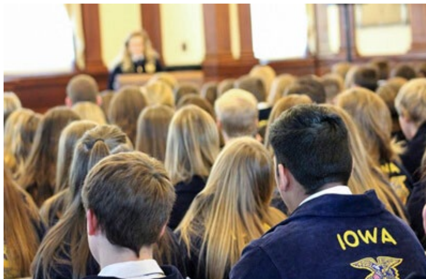
Students at an Iowa FFA event