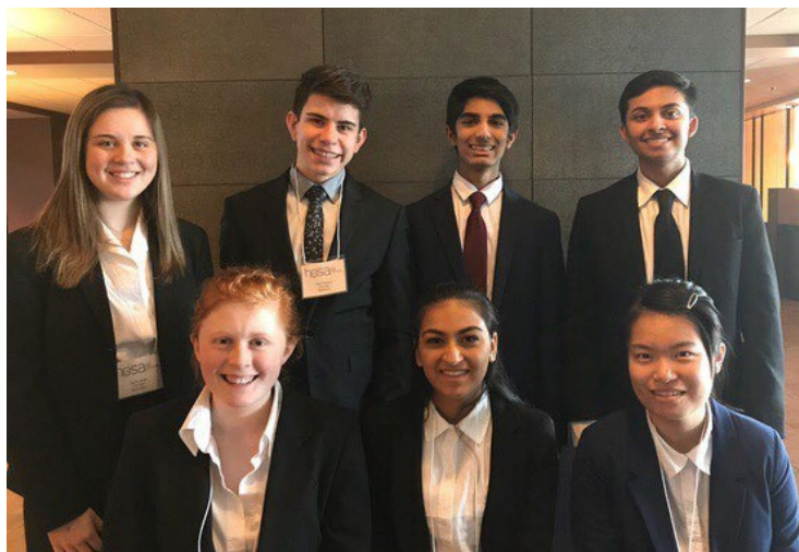
An Iowa HOSA school team at a statewide event