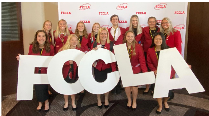
Iowa FCCLA students at a national conference