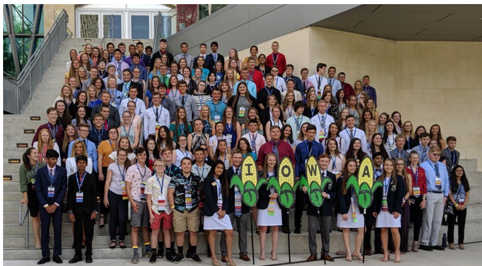
Iowa FBLA students at a national conference