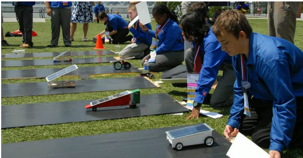
Students at a Technology Student Association (TSA) event

Community service and being a servant leader is a large part of all CTSOs. By participating in community service activities and projects, students recognize how they fit into the larger community. Community service also connects students to business and industry while building skills.