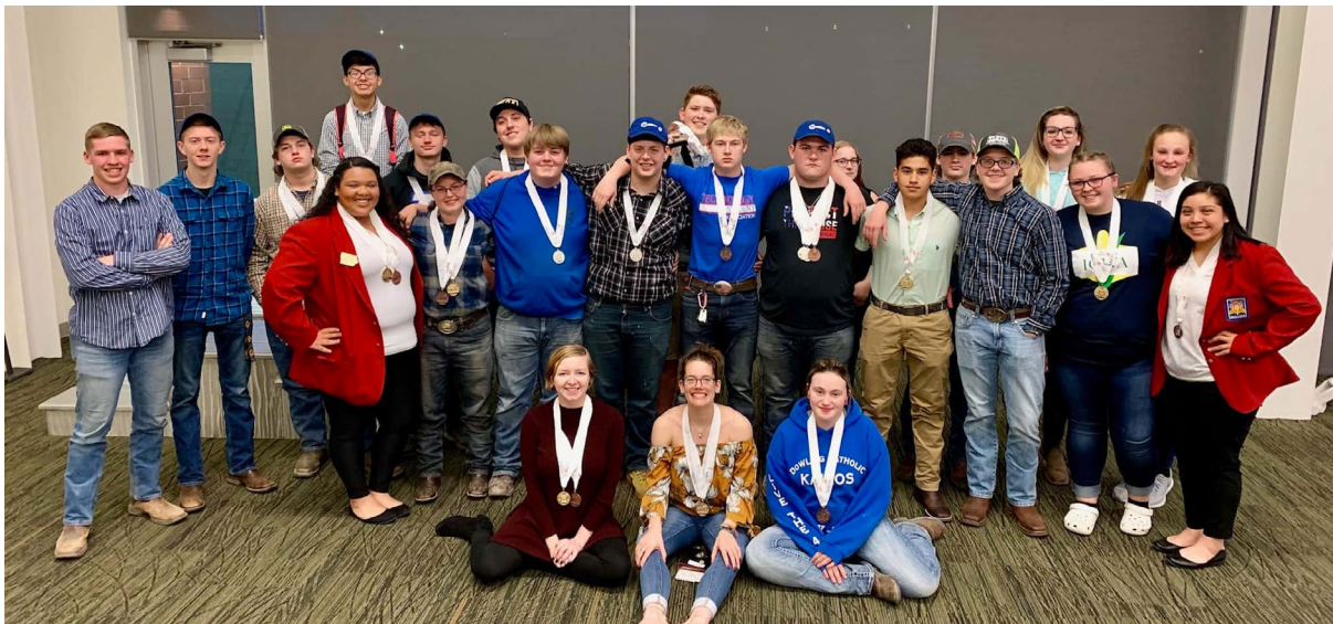
Iowa SkillsUSA students