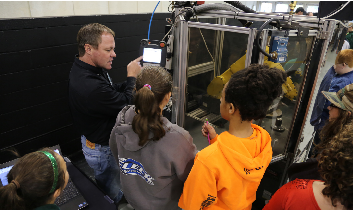
An engineer demonstrates computer numeric-controlled robotic manufacturing at Vermeer Corporation, Pella.